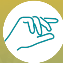
Hand Deformities and Injuries