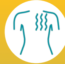
Burn Scar Contractures