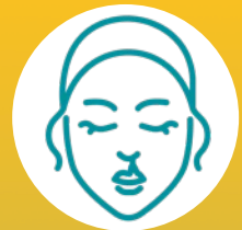
Cleft Lip and Palate